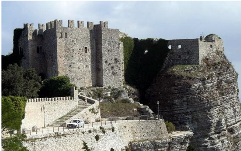
Erice's Castelo di Venere, commemorating Aphrodite